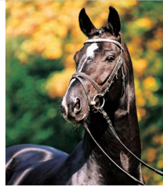
Famous De Niro: Leading sire in the global breeding of Dressage horses