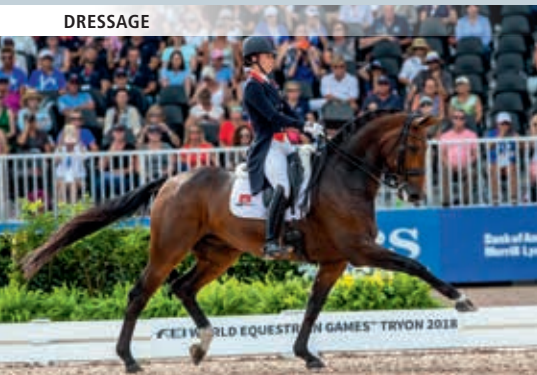
Mount St. John Freestyle by Fidermark/Donnerhall under Charlotte Dujardin won the Individual Bronze Medal at the World Equestrian Games in Tryon 2018.

The breeding philosophy of the Hannoveraner Verband is to belong to the top studbooks of the world for dressage, show jumping and eventing. Our horses should be suitable for the professional and the amateur rider. Therefore, a key element of our breeding programme is rideability. We are open to new bloodlines but want to keep the identity of the Hannoveraner.