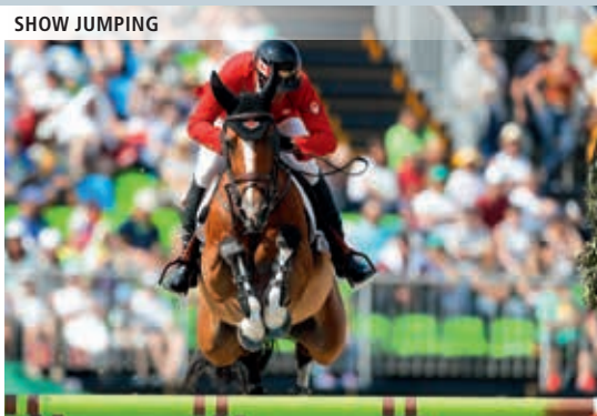
Fine Lady by Forsyth/Drosselklang II winner of the Bronze Medal at the Olympic Games in Rio de Janeiro with Canadian rider Eric Lamaze.